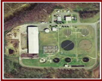
Aerial View of the First Broad River WWTP

The sewer collection system consists of gravity sewer lines, lift stations, and force mains that convey wastewater to the First Broad River WWTP. The City owns and maintains 211 miles of gravity sewer and force main lines with 19 lift stations. The City of Shelby also maintains five (5) lift stations for Fallston and three (3) for Kingstown.