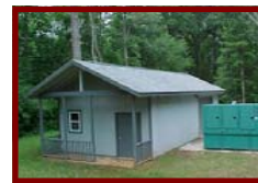
Sewer Lift Station