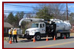
Field Operations Flush Truck

Plant Maintenance conducts inspections of all lift stations and performs both preventative and corrective maintenance on the stations and the force mains. The City's lift stations are equipped with alarm systems and are served with back-up generation (either permanent or portable capabilities).